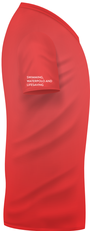
Right sleeve: Club/Society Text