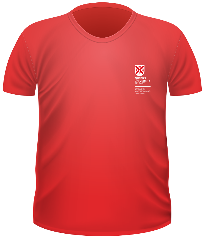
Front: Queen's / Society lock-up identity