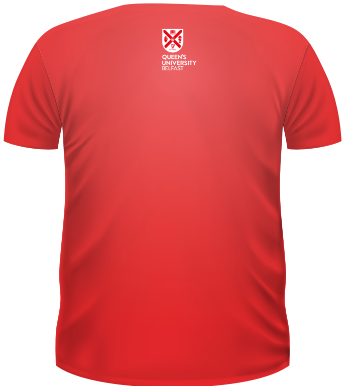
Back: Queen's identity (stacked)