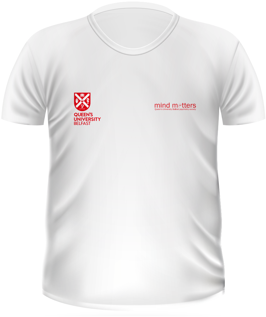
Front: Queen's identity (stacked)